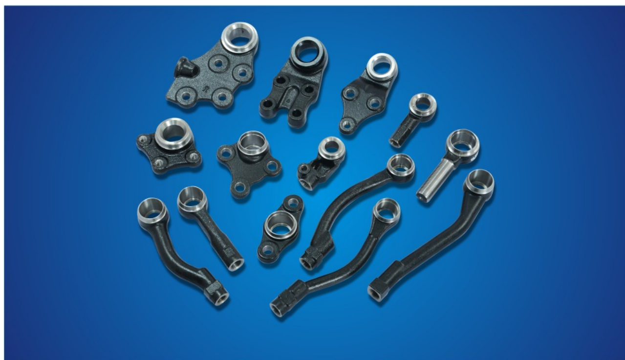
球头拉杆系列 Ball Joint, Tie Rod End