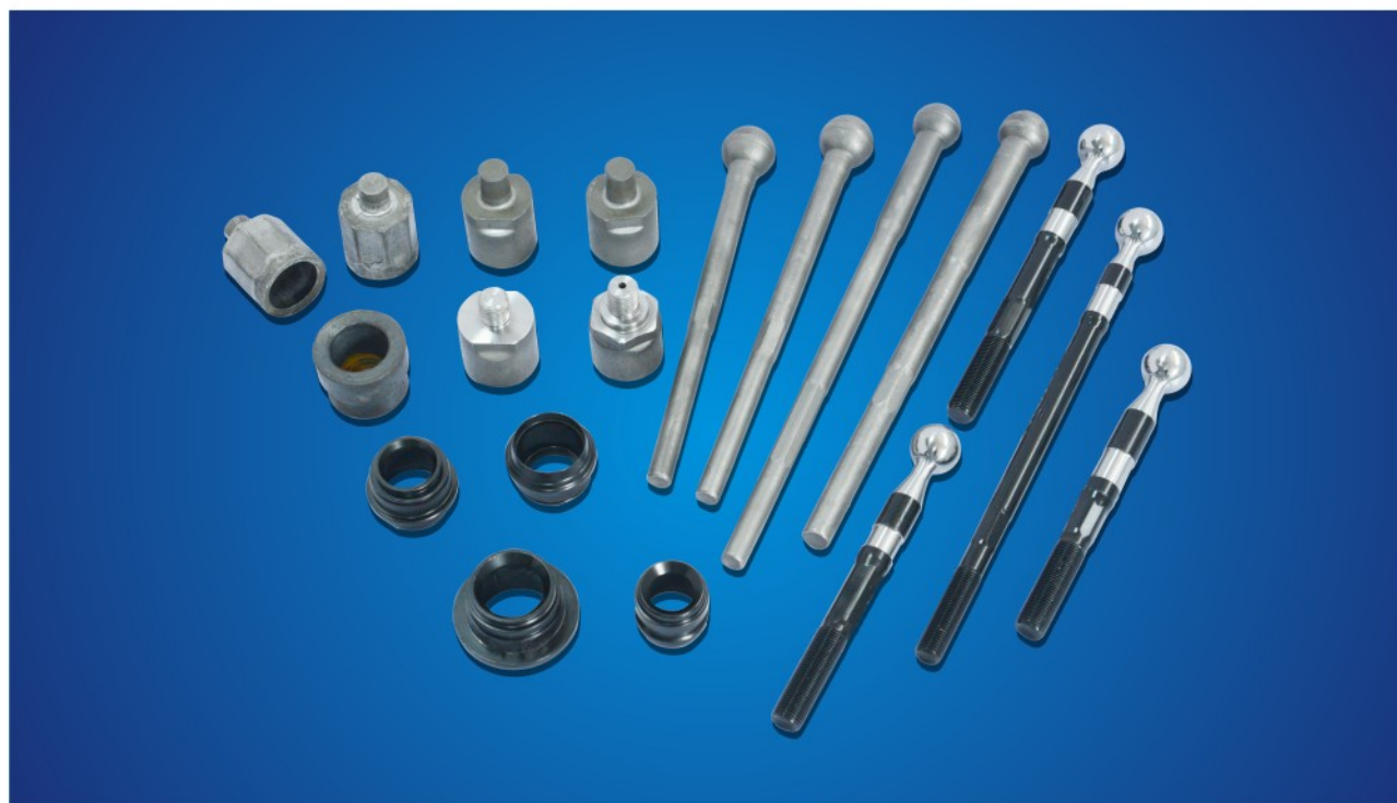
拉杆、球壳系列 Rack end , Ball Housing