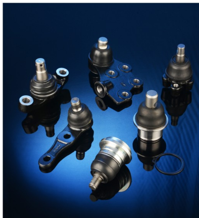
现代 / 起亚 HYUNDAI / KIA