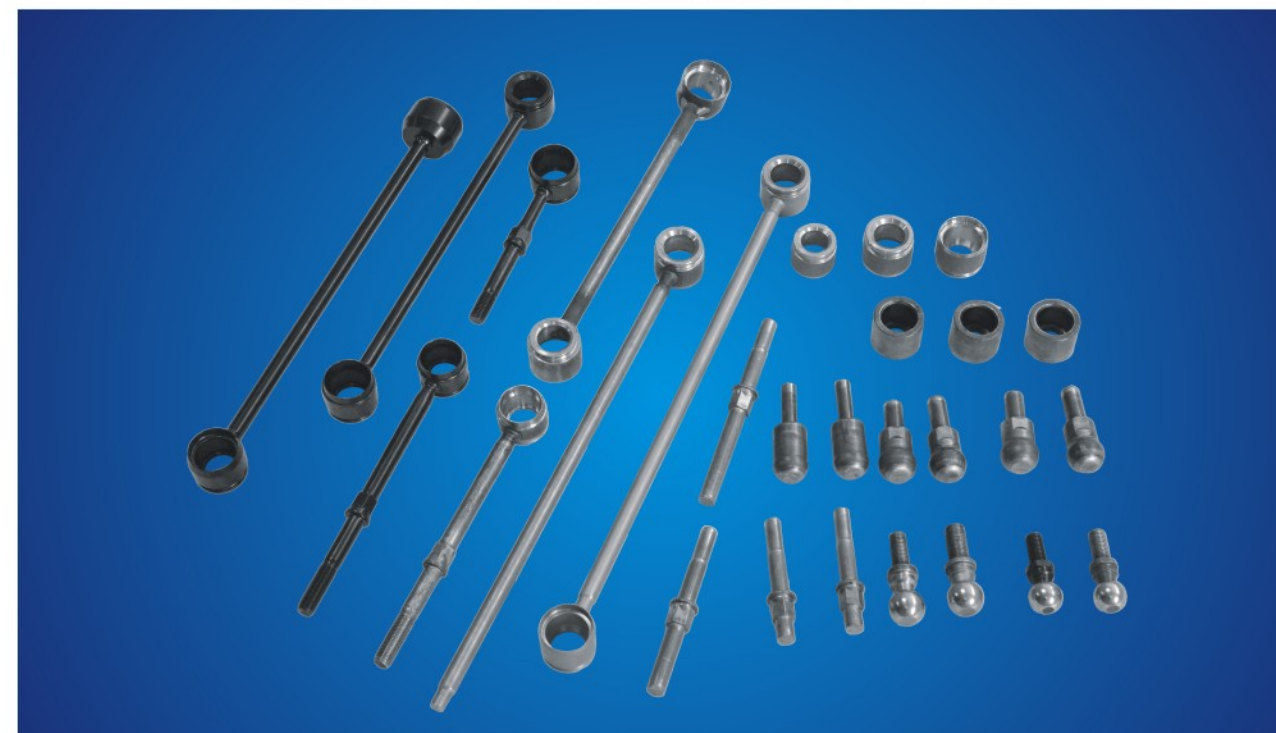
平衡杆、球销系列 Stabilizer Link, Ball Pin

From raw materials to finished products, one-stop production and processing services are provided to create more competitive prices for customers