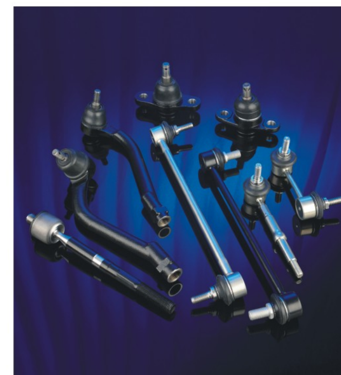
现代 / 起亚 HYUNDAI / KIA